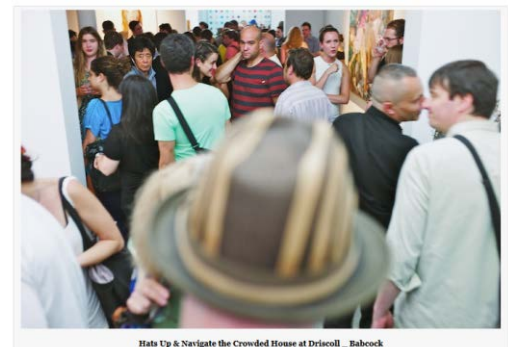
Hats Up & Navigate the Crowded House at Driscoll | Babcock